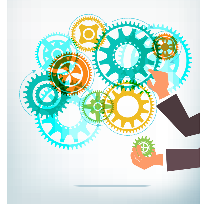
Ethernet Private Line service allows employees to access company assets via a private connection, bypassing the Internet altogether.

But there are other technologies on the horizon, which affect both how home workers connect and how they might increase security.